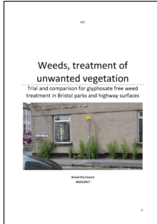
Cotham Trial (2017) Bristol City Council